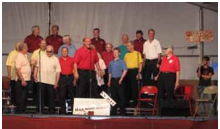
The High Point Harmonizers singing with an octet of Hunterdon Harmonizers at the New Jersey State Fair.