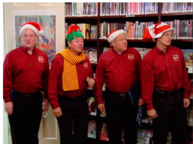
Untamed at 50th Anniversary celebration of the library in Raritan.