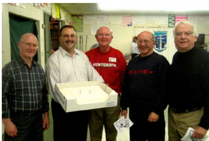
Monthly birthday cake. In the photo are some of the April birthday boys.