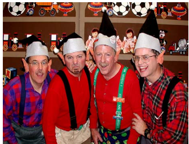
Voice Activation (The Very Bad Elves)