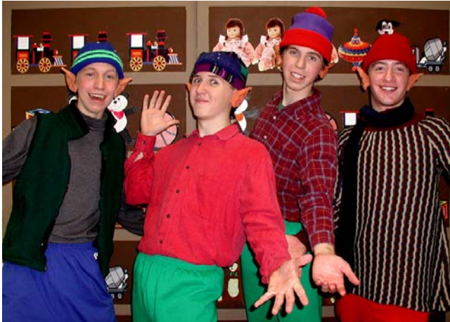
Scarred for Life