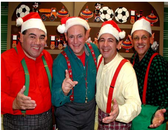
Harmony Square (The Good Guys)