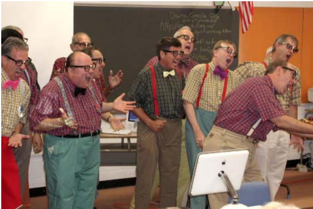
Could you really love this geek? (or these geeks?)