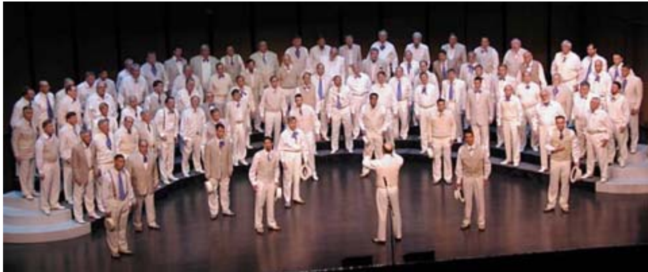
The Alexandria Harmonizers at their show!